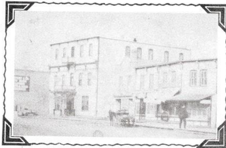
Was torn down around 1927